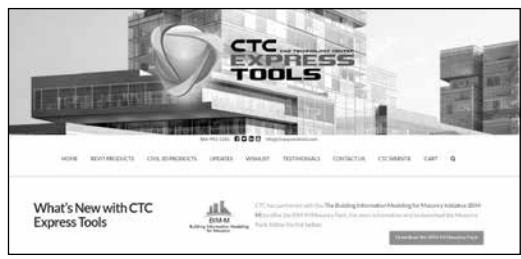
BIM-M plugin for REVIT CTC Express tools