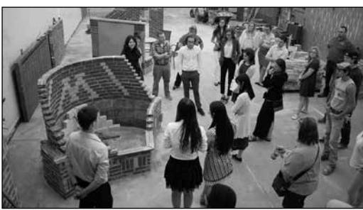
Final group presentation