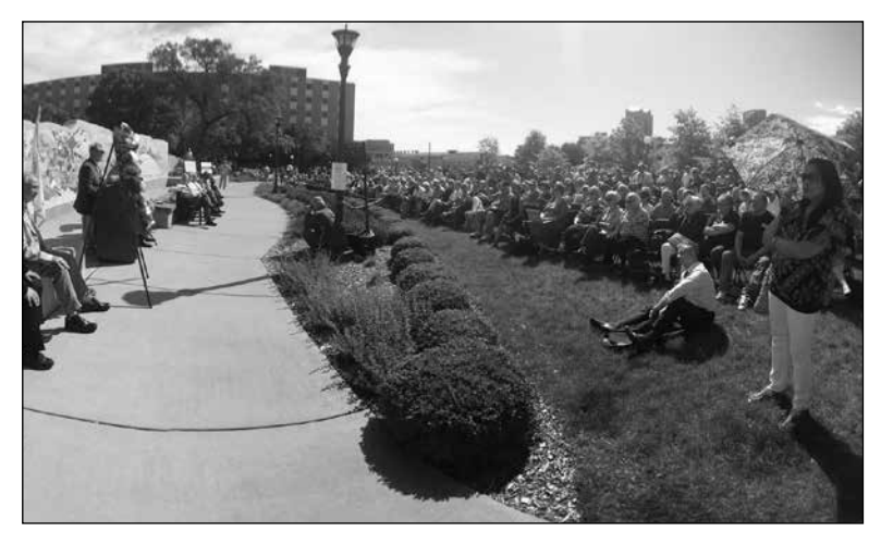
More than 400 people attended the dedication of the Workers Memorial mural in May at the Minnesota State Capitol grounds.