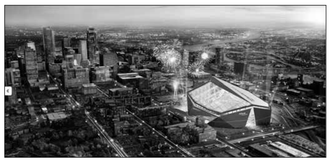
For more information on the U.S. Bank Stadium, visit usbankstadium.com.

On Dec. 3, 2013, a ceremonial ground breaking took place to signify the start of construction of the U.S. Bank Stadium in Minneapolis. The towering 31-story high structure would feature the only ETFE roof on a sports facility in the United States. This clear, lightweight, yet highly durable copolymer plastic would make the stadium usable year around at a lower cost than a retractable stadium.