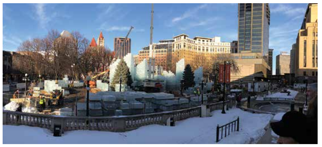
See page 6 for complete story and additional photos.