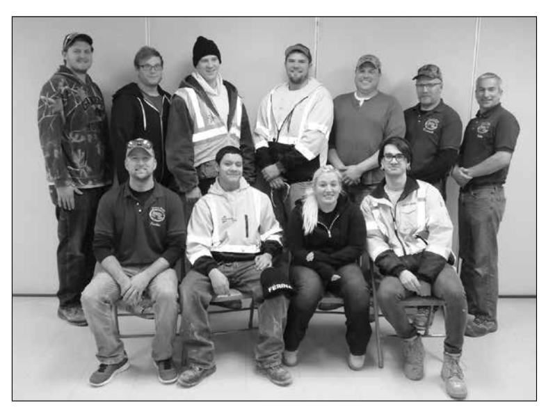
The 1st Year Pointer, Caulker and Cleaner (PCC) Apprentices were sworn in at the Chapter #1 monthly union meeting in Minneapolis on Feb. 13, 2017.

www.facebook.com/ BACTrainingCenterMNandND and EARN a Member Rewards Point...It's that easy!