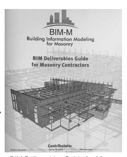
BIM Deliverables Guide for Masonry Contractors

with a local signatory mason contractor to demonstrate that a masonry wall system is more cost effective and schedule friendly, than a precast wall to a general contractor. The talks are in the preliminary stages and the G.C. and owner are very interested in having a masonry wall system that meets the project schedule, budget and complies with current energy code for the harsh Minnesota climate. This could be a win-win for the general contractor, the owner, and members of BAC Local #1. Stay tuned.