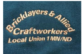
Logo Option 4 The Arch