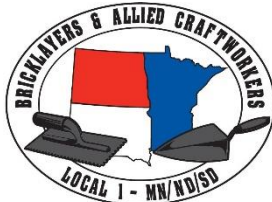
Logo Option #2 The States