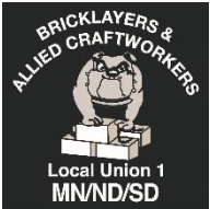
Logo Option #1 The Bulldog

Please select your award(s) and return the form to BAC Local Union 1 via Email to info@bac1mn-nd.org , or return to any BAC Business Representative