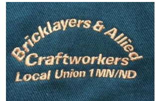
Logo Option 4 The Arch