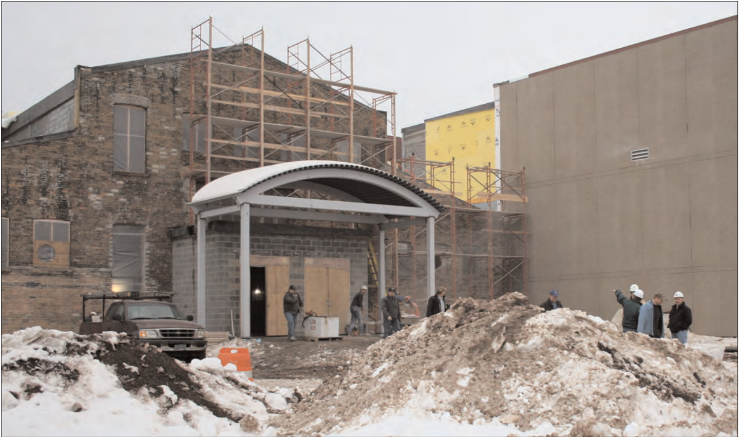
An exterior photo taken just before Christmas 2007 shows the original Clyde Iron, left, being converted to Heritage Hall, a central structure that will house concessions and utilities. To the right is the first of two sports pavilions.