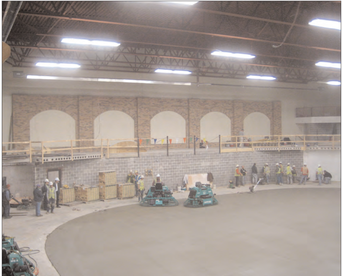
Year-round hockey, viewed by spectators in 1,200 bleacher seats, will be part of the pavilion that opens in April 2008. At the rear of this photo can be seen the brick archways contributed by BAC and other labor unions.