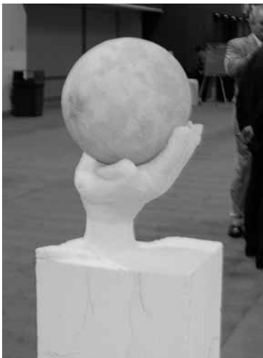
Autoclaved aerated concrete carved at the IMI Booth at the 2010 AIA Convention November 2 – 5, 2010, in Minneapolis. This is a free-form sculpture piece of an arm and hand emerging out of a raw block of material. The carving is also designed to hold a 7.5" diameter ball made of Indiana limestone. The total time spent - approximately 5.5 hours.

The option for the future is clear. As our industry changes we must be ready to change along with it.